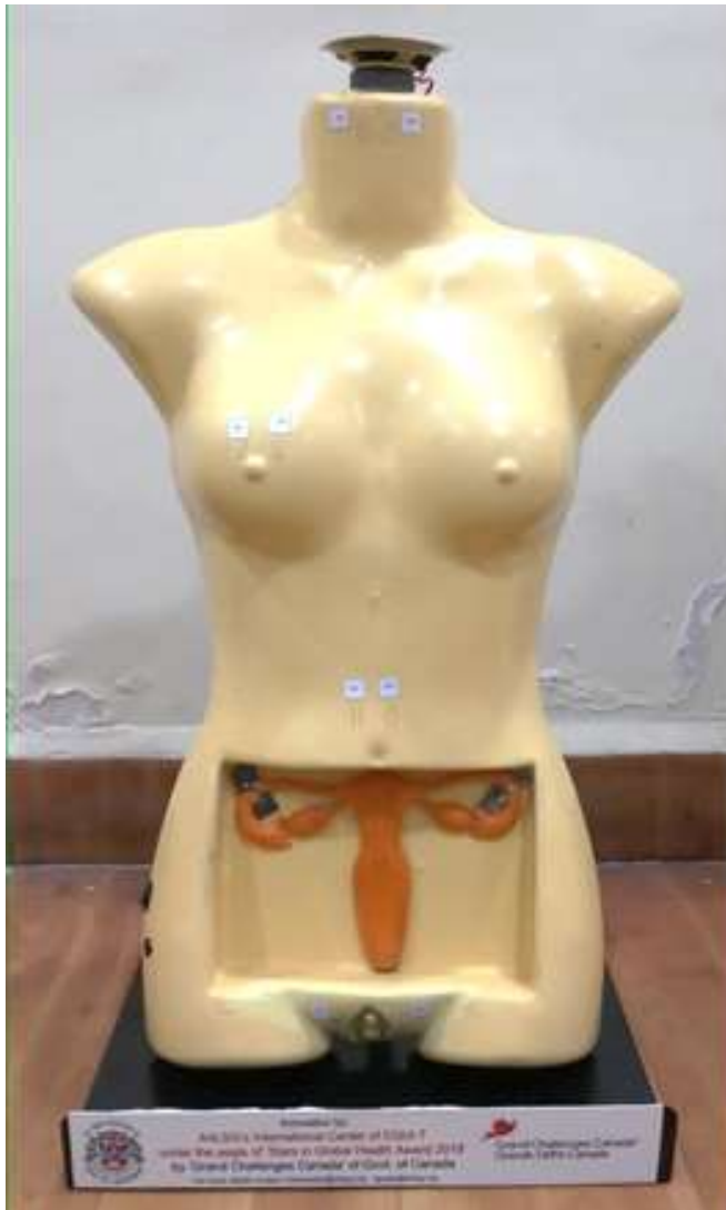
Photo of Audio-Tactile Model 'Khushi' : Life Size Three Dimensional Tactile Model fitted with Touch Based Sensors linked with Audio Commentary